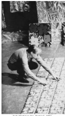
Andy Warhol in der „Factory“, 1964