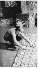
Andy Warhol in der „Factory“, 1964