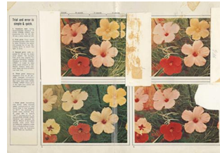
Abb. 1: Zeitschrift „Modern Photography“, Juni 1964