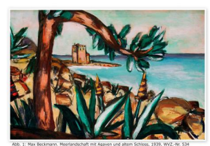
Abb. 1: Max Beckmann, Meerlandschaft mit Agaven und altem Schloss, 1939, WZ-Nr. 534